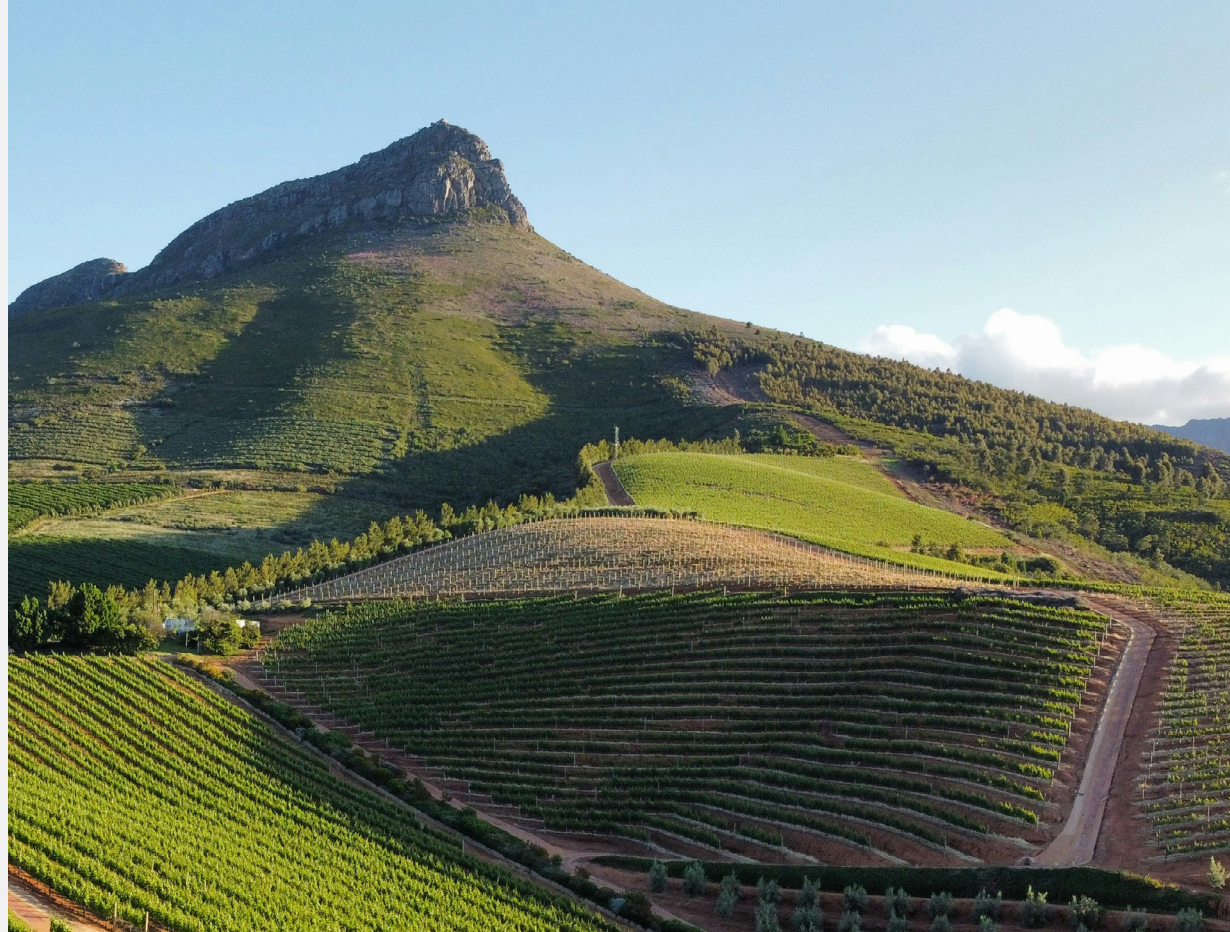
Cost Per Person

Entrance Fees (at your own account) = Wine Tasting Fees (R80pp- R150pp), Museum Fee (R60pp) – Cash or Credit Cards accepted